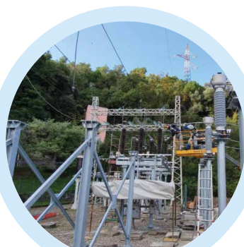
GNL ITALIA DI PANIGAGLIA PLANT, LA SPEZIA