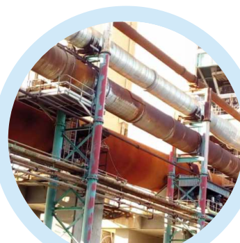
BUZZI UNICEM SPA PLANT, AUGUSTA