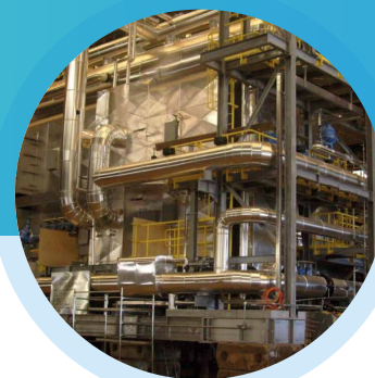
SKID OIL & GAS MACCHI DIV. SOFINTAR