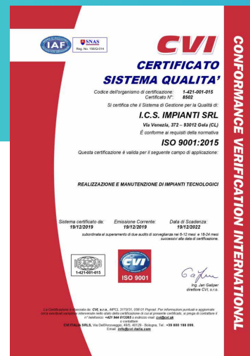
QUALITY SYSTEM CERTIFICATE