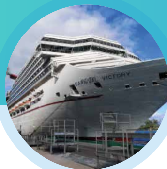
M-V CARNIVAL VICTORY