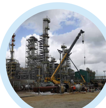
STAATSOLIE MAATSCHAPPIJ SURINAME N.V.