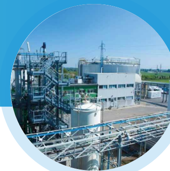
3V GREEN EAGLE PLANT, MESTRE (VE)