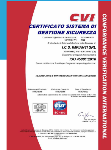
SAFETY MANAGEMENT SYSTEM CERTIFICATE