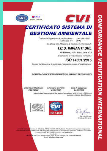
ENVIRONMENTAL MANAGEMENT SYSTEM CERTIFICATE

I.C.S. IMPIANTI has the quality, safety and environmental certifications ISO 9001, ISO 45001 and ISO 14001. The company guarantees its employees and customers compliance with all the conditions necessary to operate within the construction sites in absolute safety and in compliance with the provisions of the reference regulations. In fact, the business model combines regulatory obligations, constant support and training of employees and overall work organization.